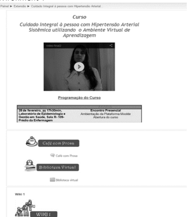
Figure 1 - Initial screen of the course "Integral Care for the Person with Systemic Arterial Hypertension, using the Virtual Learning Environment".

For the preparation of the course, the researchers defined the planning of the proposed activities, the deadlines determined for each one of them, the motivational strategies, as well as the design of the icons/design for access and navigation in the course. An introductory motivational video of welcome and guidance regarding the course was recorded. The course interface was carefully designed to favor a learning route and structure the path to be taken by the student during the course.