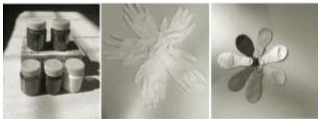
Figure 2 - Educational tools used in the dynamics of hand contamination by microorganisms, Fortaleza, Ceará, Brazil, 2018.