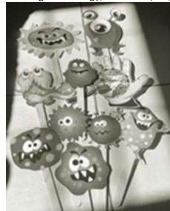
Figure 1 - Representation of microorganisms used in educational nursing technology, Fortaleza, CE, Brazil, 2018.

The first stage had as an educational strategy an expository-participative conversation circle with the children sitting on the floor, in the shape of a circle, in which the students demonstrated the correct hand hygiene technique, following the step by step according to Anvisa (10) . Alcohol gel was used to demonstrate the steps. Illustrative drawings were used, representing the microorganisms (worms), as shown in Figure 1. The figures were passed among the children in the circle in order to explain to them how disease transmission occurred and what preventive measures were intended to interact with them, using these figures in the form of cartoons, as a way to facilitate their process of understanding about microorganisms that are invisible to the eyes, but that are present in the hands when not sanitized.